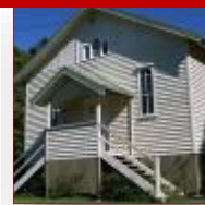
St John Bosco Church 21 Anne Street Kenilworth

St Augustine's Church Palmwoods Mass Time Third Sunday of the Month 5:30pm