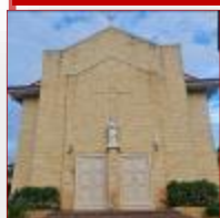
St Joseph's Church P.O. Box 369 177 Currie Street Nambour