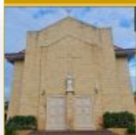
St Joseph's Church P.O. Box 569 177 Currie Street Nambour