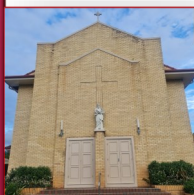
St Joseph’s Church P.O. Box 569 177 Currie Street Nambour