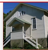
St John Bosco Church 21 Anne Street Kenilworth

St Augustine’s Church Palmwoods Mass Time Third Sunday of the Month 5:30pm