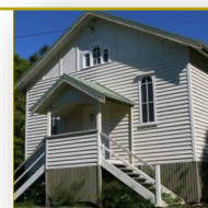
St John Bosco Church 21 Anne Street Kenilworth

St Augustine’s Church Palmwoods Mass Time Third Sunday of the Month 5:30pm