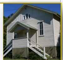
St John Bosco Church 21 Anne Street Kenilworth

St Augustine’s Church Palmwoods Mass Time Third Sunday of the Month 5:30am