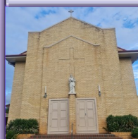
St Joseph's Church P.O. Box 569 177 Currie Street Nambour