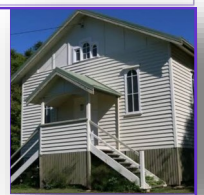
St John Bosco Church 21 Anne Street Kenilworth

St Augustine’s Church Palmwoods Mass Time Third Sunday of the Month 5:30am