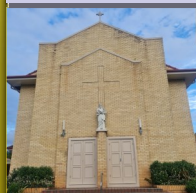
St Joseph's Church P.O. Box 569 177 Currie Street Nambour

On the reverse is provided a Blessing of the Crib . Small children could place the figures and older children or adults could read the blessing.