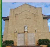
St Joseph’s Church P.O. Box 569 177 Currie Street Nambour

‘November is the month of Holy Souls’. Envelopes are available in the church to add your loved ones names to and to be placed in the plate or delivered to the office for the names of the souls to be added to the 2022 Book of Remembrance.