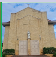
St Joseph’s Church P.O. Box 569 177 Currie Street Nambour

Youth Group: Our Youth gathering is back again. Please join in next Friday 29th July at 4:00pm in the Community Centre.