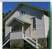
St John Bosco Church 21 Anne Street Kenilworth

St John Bosco Church Mass Time Third Sunday of the month 10:00am