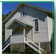
St John Bosco Church 21 Anne Street Kenilworth

St John Bosco Church Mass Time Third Sunday of the month 10:00am