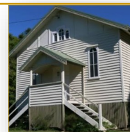
St John Bosco Church 21 Anne Street Kenilworth

St John Bosco Church Mass Time Third Sunday of the month 10:00am