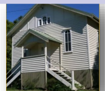
St John Bosco Church 21 Anne Street Kenilworth

St John Bosco Church Mass Time Third Sunday of the month 10:00am