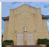
St Joseph's Church P.O. Box 569 177 Currie Street Nambour

The Mass & Reconciliation times listed below will resume to usual from May 25th, 2022.