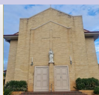
St Joseph's Church P.O. Box 569 177 Currie Street Nambour