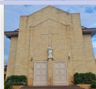
St Joseph's Church P.O. Box 569 177 Currie Street Nambour

St Joseph's Conference St Vincent de Paul Nambour Mobile: 0407859965 Office: 0754595202 Email: sj4560@svdpqld.org.au