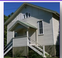
St John Bosco Church 21 Anne Street Kenilworth

St John Bosco Church Mass Time Third Sunday of the month 10:00am