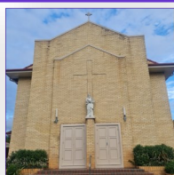
St Joseph's Church P.O. Box 569 177 Currie Street Nambour

This year, Divine Mercy Sunday falls on Sunday 24/04/2022 . To celebrate this great feast we will be holding a short adoration service following the 8am Mass. We will pray prayers of the Divine Mercy and venerate our Lord's Divine Mercy image. Please join us.