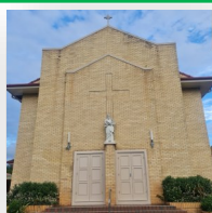
St Joseph's Church P.O. Box 569 177 Currie Street Nambour