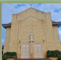
St Joseph's Church P.O. Box 569 177 Currie Street Nambour