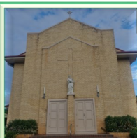
St Joseph's Church P.O. Box 569 177 Currie Street Nambour