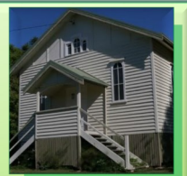
St John Bosco Church 21 Anne Street Kenilworth

St John Bosco Church Mass Time Third Sunday of the month 10:00am