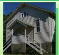
St John Bosco Church 21 Anne Street Kenilworth

St John Bosco Church Mass Time Third Sunday of the month 10:00am