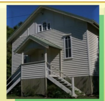
St John Bosco Church 21 Anne Street Kenilworth

St John Bosco Church Mass Time Third Sunday of the month 10:00am