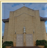
St Joseph's Church P.O. Box 569 177 Currie Street Nambour