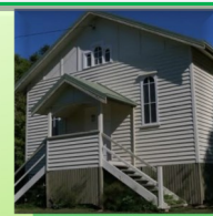
St John Bosco Church 21 Anne Street Kenilworth