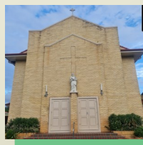
St Joseph's Church P.O. Box 569 177 Currie Street