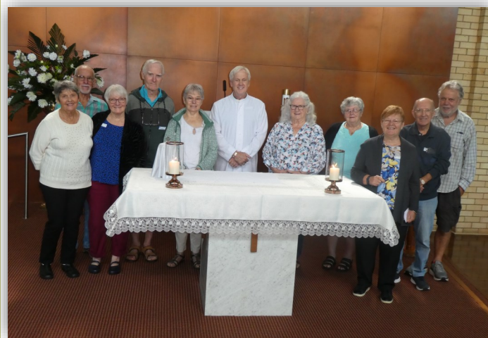
St Vincent de Paul Conference joined in retreat at St Joseph's Church on Thursday 22nd.