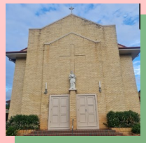
St Joseph's Church P.O. Box 569 177 Currie Street Nambour