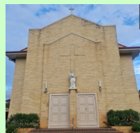
St Joseph's Church 177 Currie Street Nambour