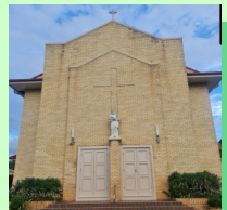
St Joseph's Church 177 Currie Street Nambour